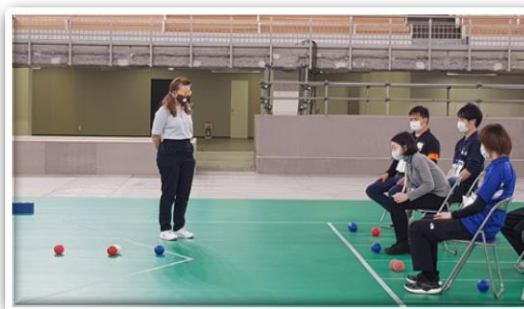
Tokyo Test Event